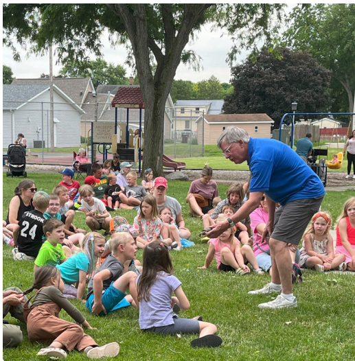
Zoo to You - Henry Vilas Zoo Visit